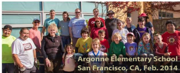
Argonne Elementary School San Francisco, CA, Feb. 2014

76 Race Street, San Jose, CA, Planet Earth... (408) 292-9993 | middlebrookcenter.com